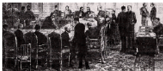
THE BERLIN CONFERENCE

Because of its size, surface features, climate, resources, and strategic importance, Africa became a prime candidate for conquest by ambitious European empires. Although Africa is physically remote from the power centers of Europe, North America, and Asia, it is surrounded by water and can therefore be reached easily from the other continents. This meant that the Europeans needed to establish rules for dealing with one another if they were to avoid constant bloodshed and competition for African resources. The Berlin Conference established those ground rules.